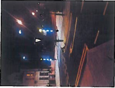
Example of new style flashing beacons